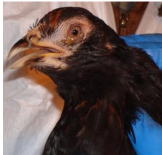
Figure 2. A chicken infected with Mycoplasma

Respiratory diseases. Respiratory diseases affect the respiratory tract and are the most common diseases in chickens. Table 8 shows some of the common respiratory diseases; most can be prevented by good biosecurity backed up with vaccination.